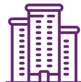
UK Wholesale, Residential + Designated Authorities