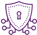
Cyber, Media + Technology