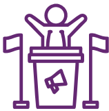
Credit + Political Risk