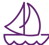
Marine + Cargo